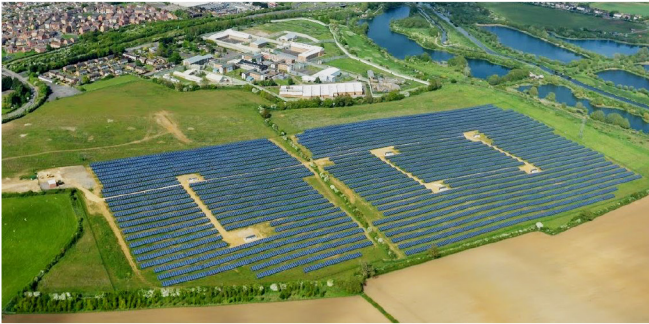
The proposed solar farm would be much larger than this one near Wellingborough

Island Green Power has announced that they intend to pursue a 60-year permission for a 500MW solar farm with battery storage covering approximately 2,350 acres of land. The majority of the land is currently productive farmland. The proposal is ten times the size of the largest solar farm in the county and would be the largest permitted in England to date. It comprises seven blocks of land of varying sizes connected by underground cable. The batteries would be capable of storing